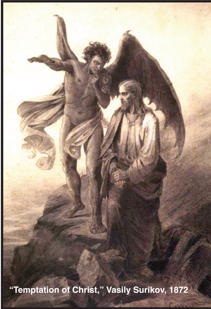
“Temptation of Christ,” Vasily Surikov, 1872

St Basil's Parish was founded in 1856 by the Priests of the Congregation of St. Basil, also known as the Basilian Fathers. We are the collegiate church of the University of St. Michael's College at the University of Toronto, as well as being the parish church to our parishioners who come to worship here from all